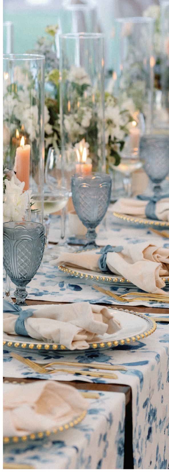
TOP TO BOTTOM Blue and white floral table linens tie in the New England charm. // Bridesmaids dress in blush gowns.